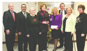
Opening of Shore Medical Pavilion at Dorchester celebrated January 27, 2015 In "Around Dorchester"