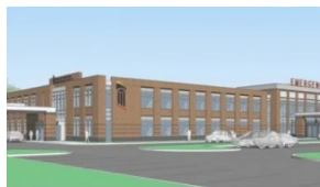
New health care facility plans wins approval May 11, 2019 In "Health and Fitness"