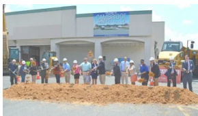
Cambridge Marketplace ‘for the community’ June 8, 2017 In "Around Dorchester"